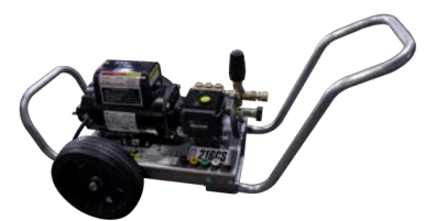
Electric 216CSE & 320CSE Direct Drive Model