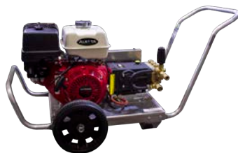
445CSBV Belt Drive Model