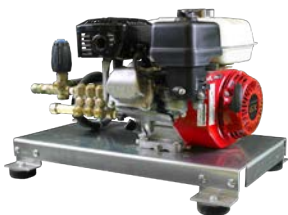
Skid Base Model