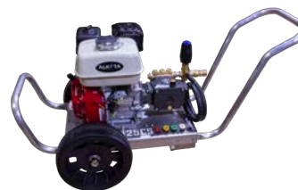
325CS Direct Drive Model